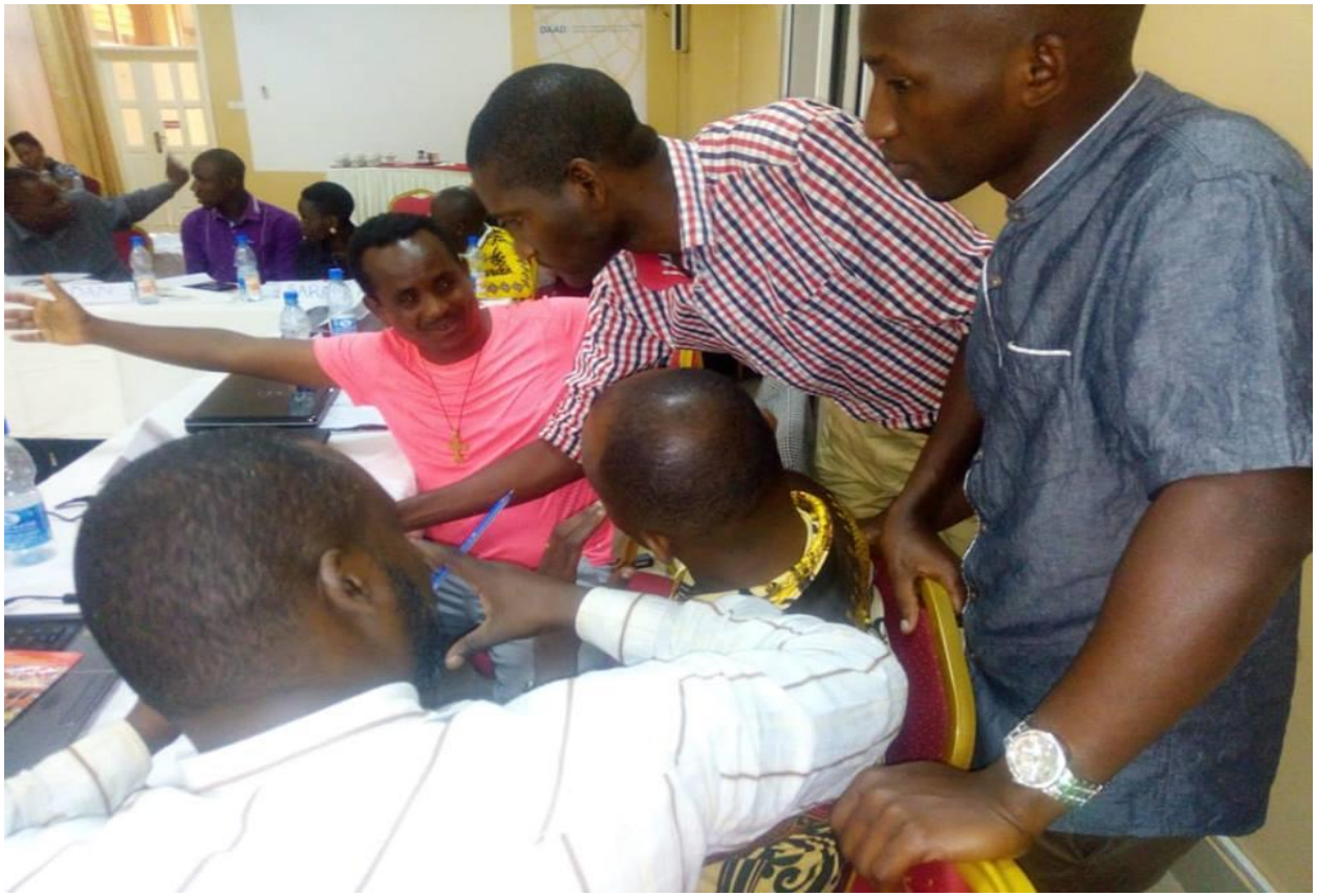
Participants holding a group discussion.