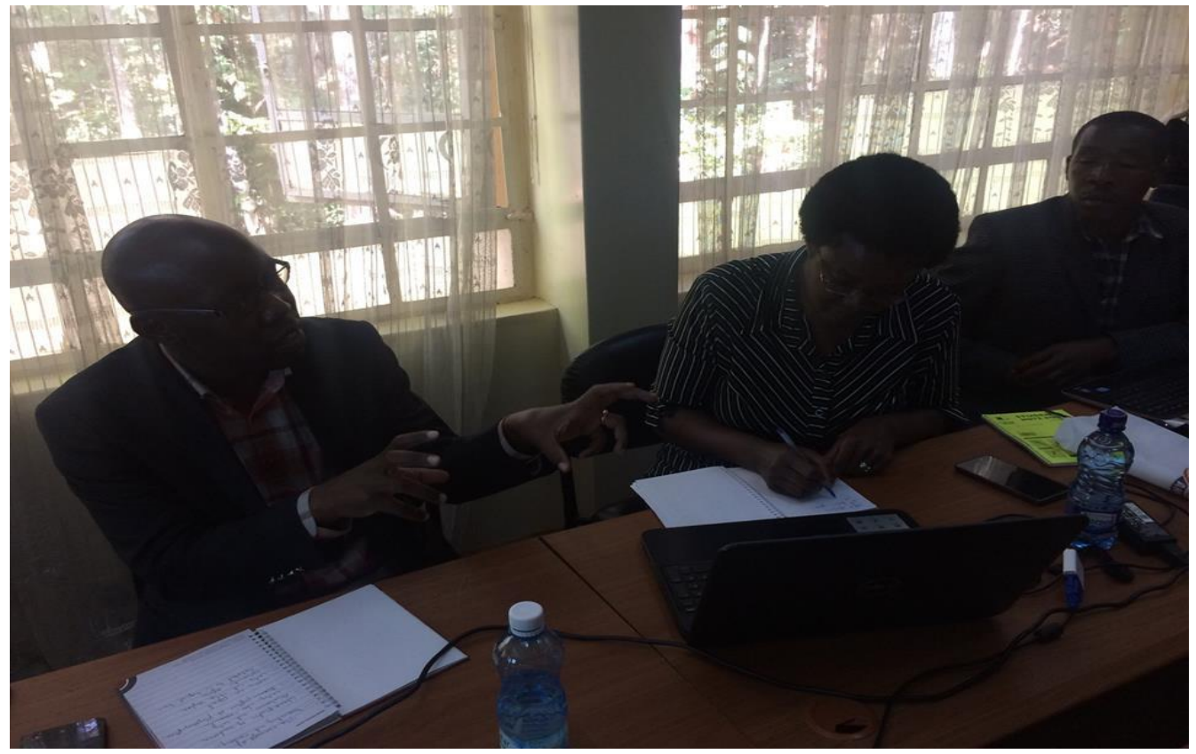
A Participant sharing his views on how to communicate to non-scientists.

Training Centre in Communication organized a two day training on Science Communication; Communicating to Non-Scientists, Policy Markers, and Media from 30<sup>th</sup> to 31<sup>st</sup> January, 2018. The training was held in the University of Nairobi, College of Biological and Physical Sciences where a total of 7 (seven) senior University of Nairobi staff attended. The participants were taken through Policy Briefs, Newsletters, E-brochures among other related fields which covered the aspects of translating the technical research work to a policy maker, to Opinion Editorials, the media and the general public.