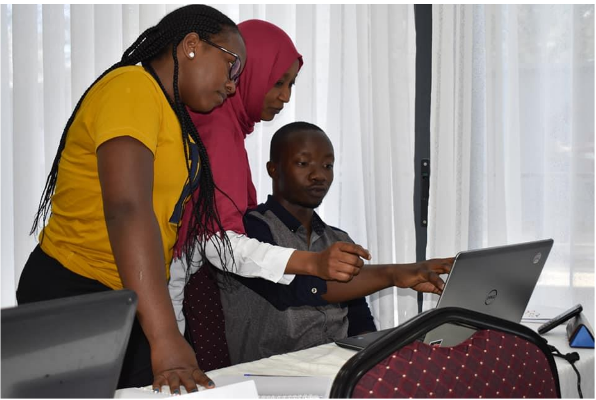
DAAD Participants discussing in one of the sessions