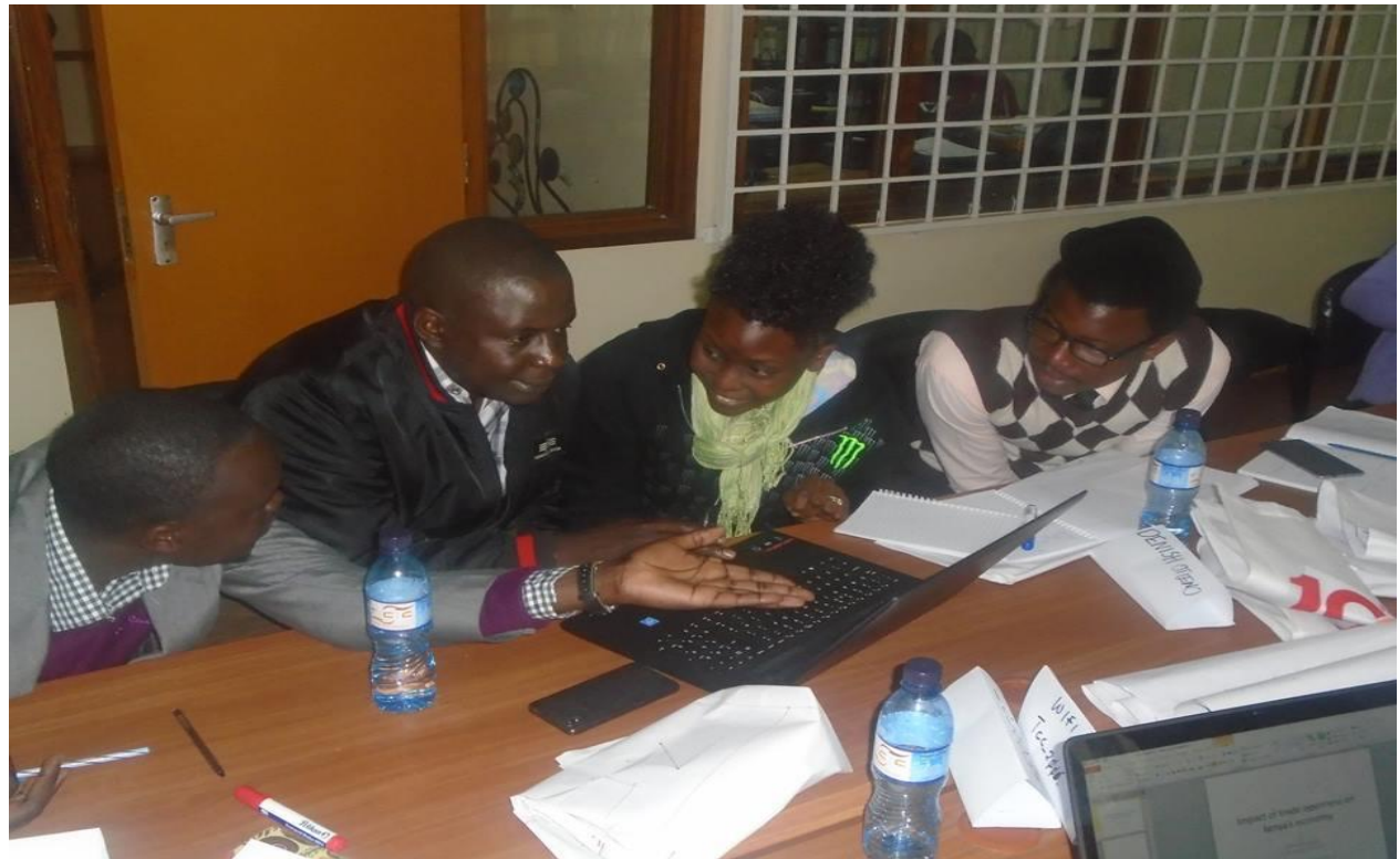
Participants critiquing titles for a Scientific Writing exercise

forms. Topics such as data analysis and presentation, publishing process, proposal writing stages and publishing process, among others, were covered.