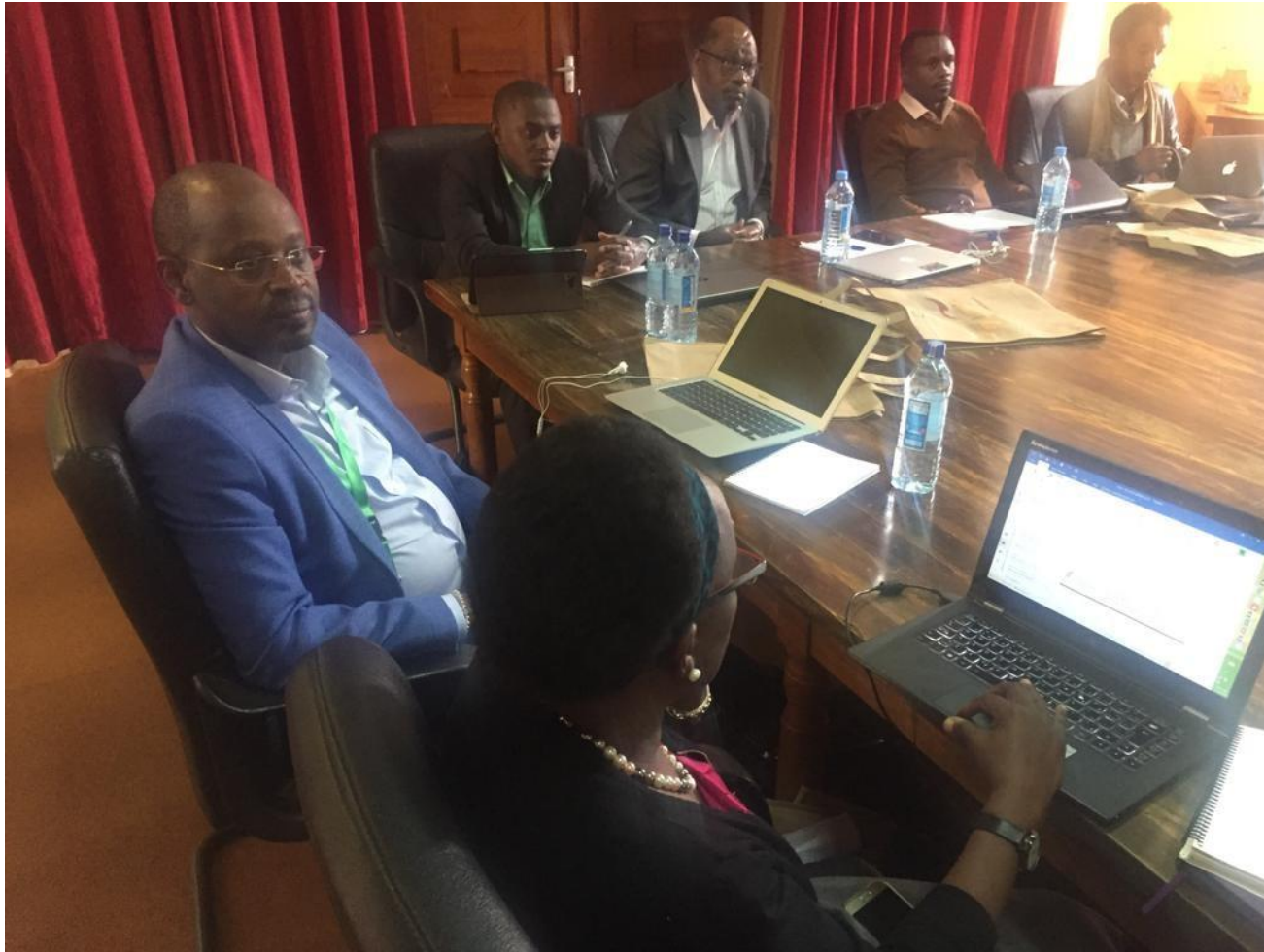
Participating research fellows during a training session at the National Museum of Kenya

Training Centre in Communication conducted a training for JRS Biodiversity Foundation Grantees on 28 th May, 2019. The training was conducted at the National Museums of Kenya and attracted a sum total of twelve (12) research fellows from Kenya, Uganda, Rwanda, Tanzania, South Africa and Madagascar. The training focused on Science Communication, Communicating to Non Scientist and Developing a Plan