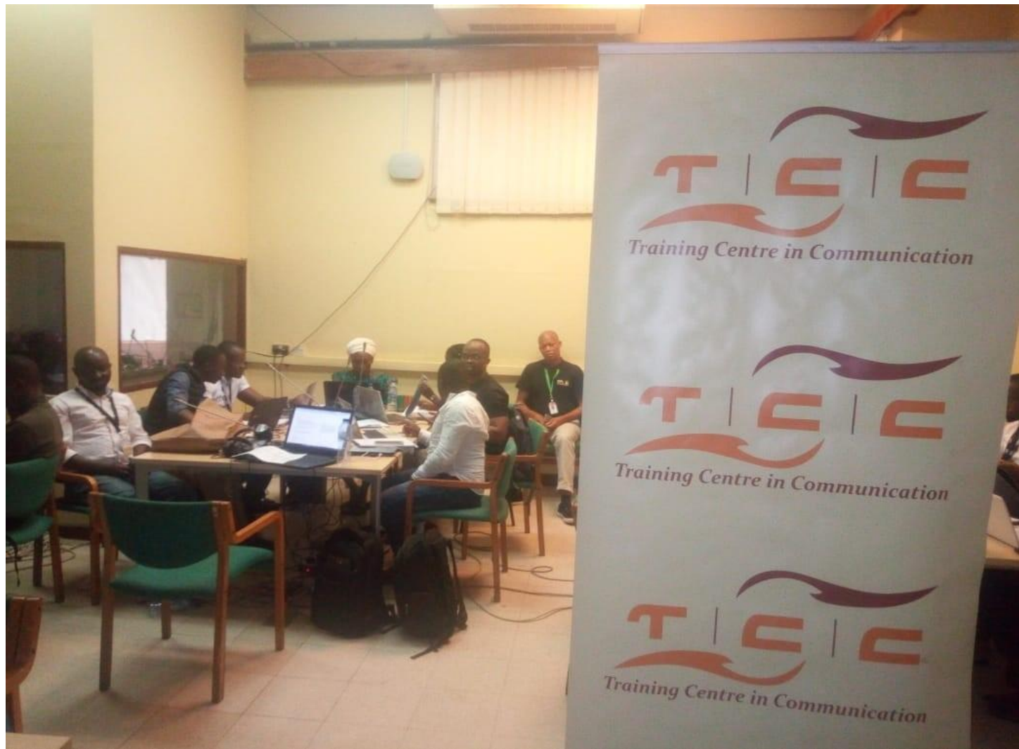
Agricultural scientist's participants from IITA CGIAR Nigeria during the training.

Training Centre in Communication conducted a training for agriculture scientists from IITA CGIAR on the 14 th to the 15 th of November, 2019. The training which was conducted in Ibadan state of Nigeria had thirty (30) participants at MSc and PhD level. The training was centered on Academic Writing and Publishing, Open Access and Oral Communication. Beyond writing academic papers and understanding the academic publishing industry, TCC also trained the researchers on how to communicate with fellow scientist which in turn guides them on working and communing at a multidisciplinary level with their peers.