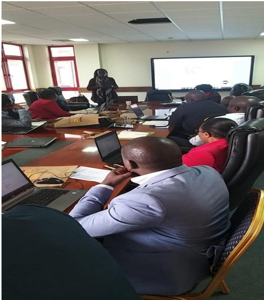
Kenya Pipeline Staff at the workshop training