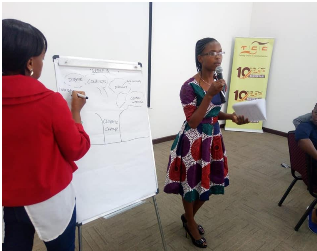
DAAD Participants presenting their group discussion during the Research Capacity building training session at Emory Hotel, Kileleshwa