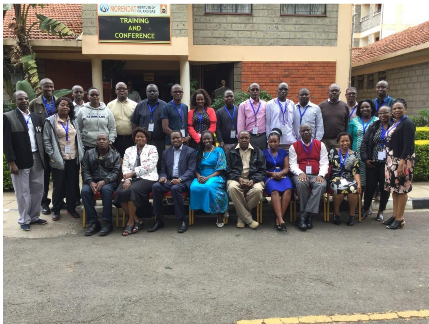
TCC Executive Director together with the Team of Kenya Pipeline Staff during the workshop training

As part of the research capacity initiatives, TCC facilitated a workshop to twenty five (25) Kenya Pipeline researchers on Resource mobilization proposal writing and Grants management at the Morendat Institute of Oil and Gas on the 13 th of November 2019. The Kenya Pipeline Company (KPC), was setting up a research and grants office and it was an honor for TCC to be part of their journey. The course on Research-Mobilization and Grants management was an integral strategic decision not only to the institute but to the researchers who will be part of the team raising money to conduct research. Raising funding for research is part of the research discovery process and it is important for scientist to know the various ways in which to go about this process.