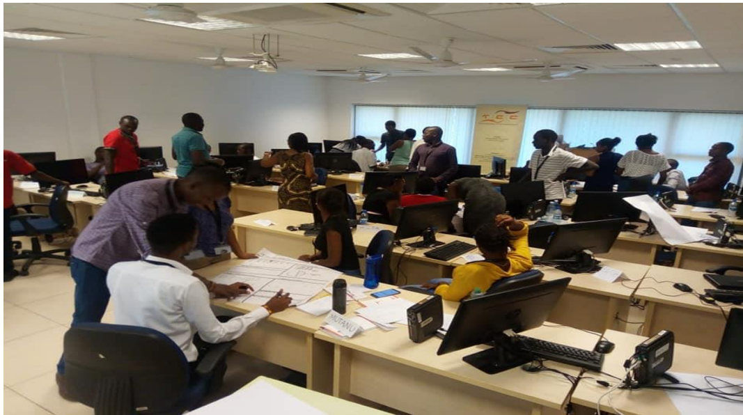
Participants from the African Research Leaders fellows in a training session at the KEMRI Wellcome Trust boardroom