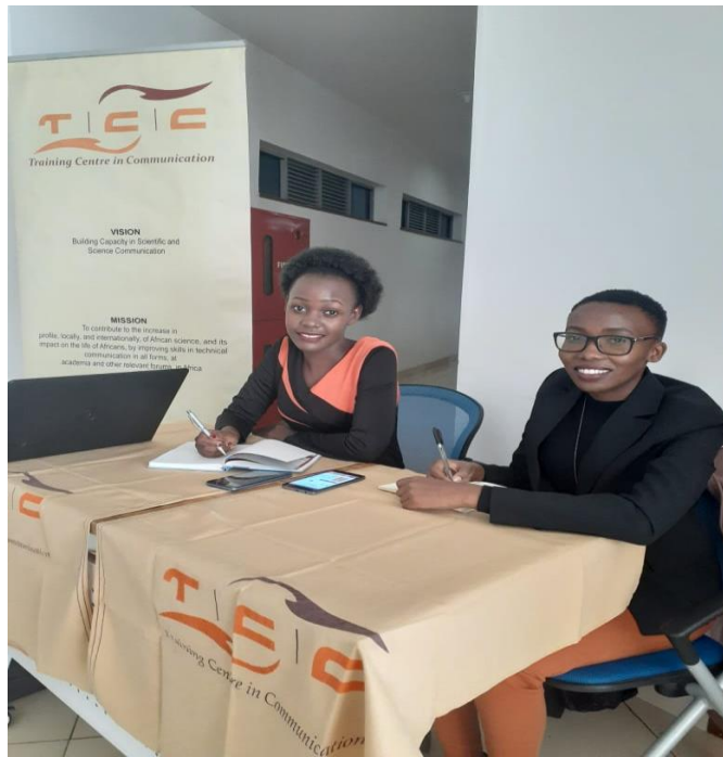
TCC exhibition desk at the EARIMA 2019 Conference

In the last quarter of 2019 TCC Africa had an information desk to promote its 2020 activities including the January and February training courses to conference participants. Interested parties asked to join the TCC mailing list to receive more information on TCCs programs. TCC also increased its increased its online presence by opening a LinkedIn social media account to elevate its reach in the online community.