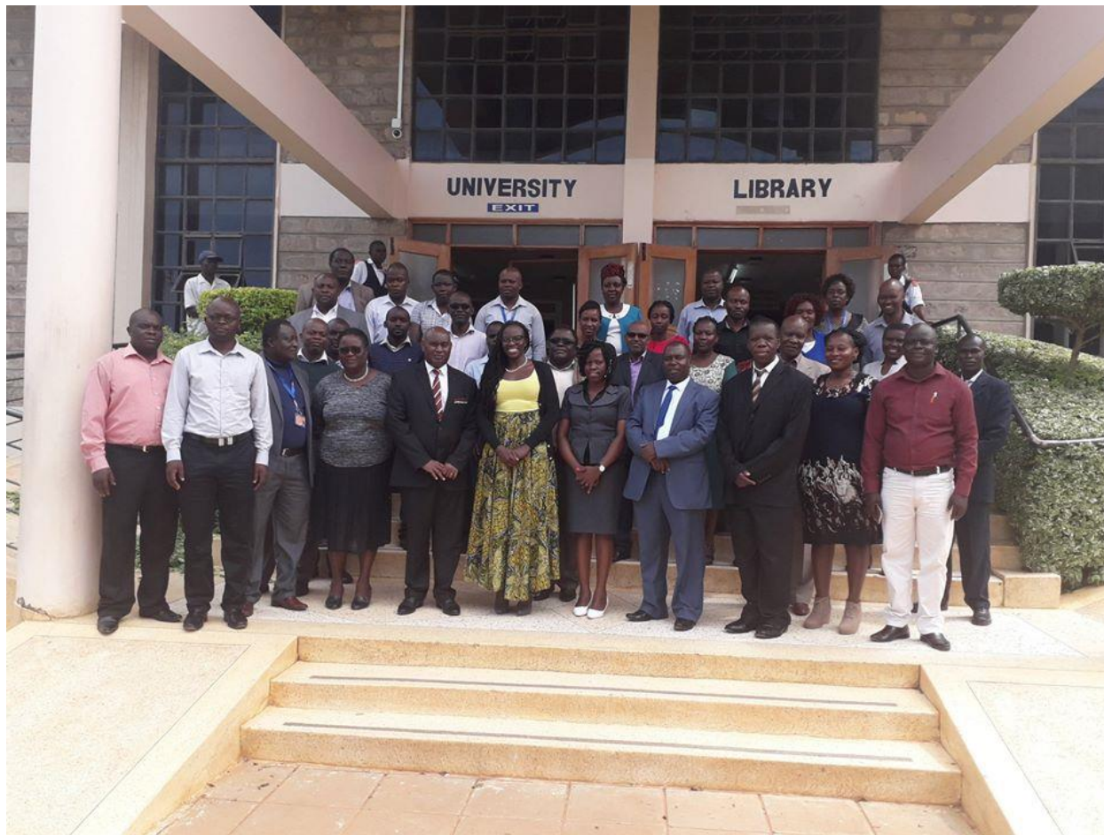
The Deputy Vice Chancellors, Directors, Deans of Schools, Librarians and Editors of the university journal pose for a picture after the workshop

The participants who were thirty (30) in number included the Deputy Vice Chancellors, Directors, Deans of Schools, Librarians and Editors of the university journal. The correct senior academic team were to begin the Research Capacity support as we further extend it to the career researchers.