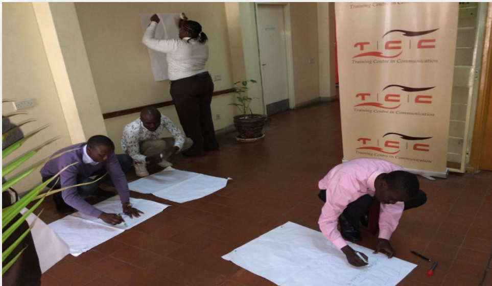
Participants doing an exercise on scientific posters