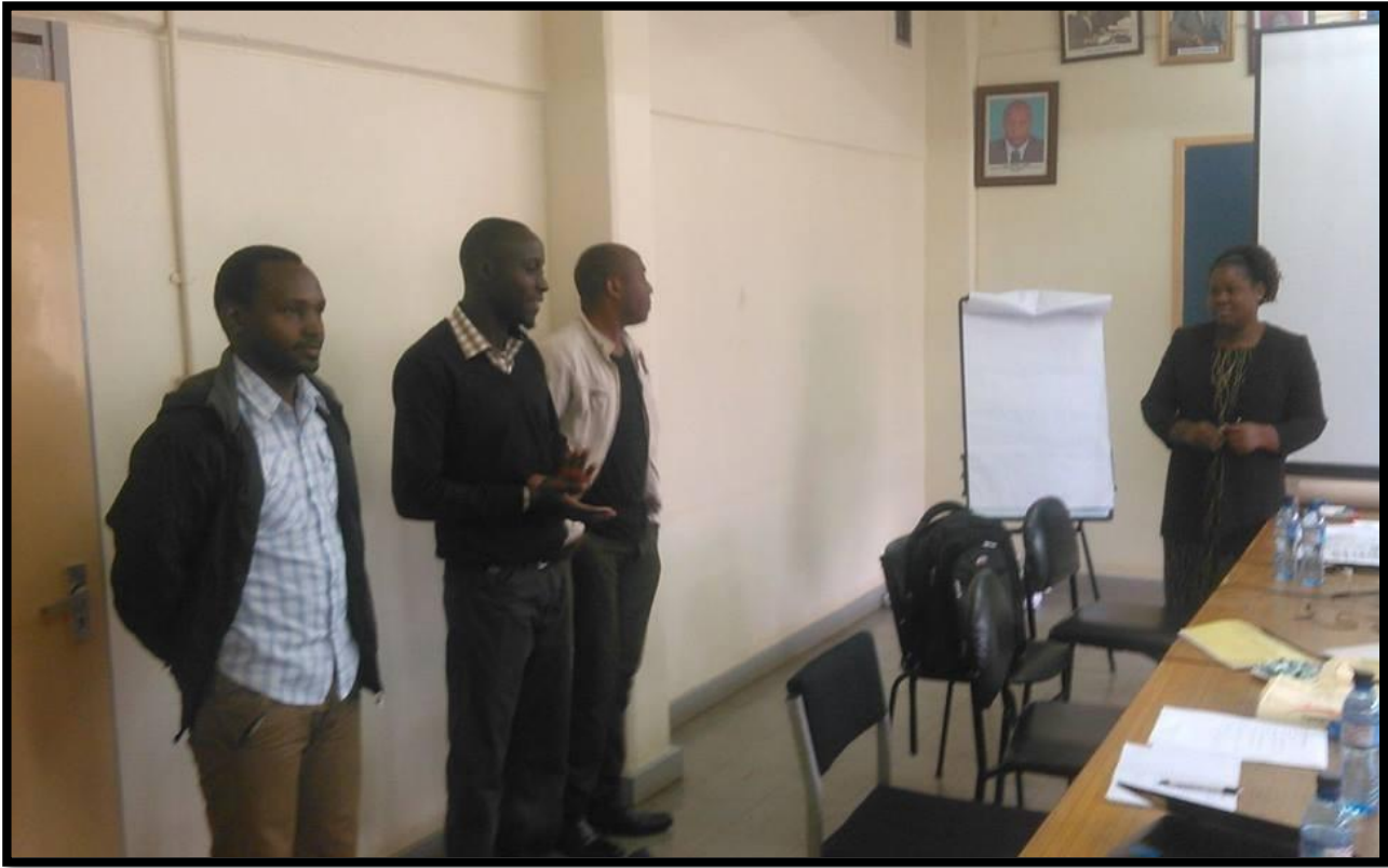
Participants during the exercise on grant management