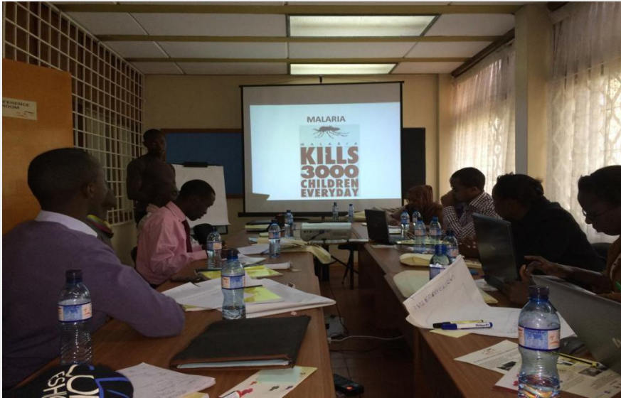
Trainees listening to a presentation by fellow participant.