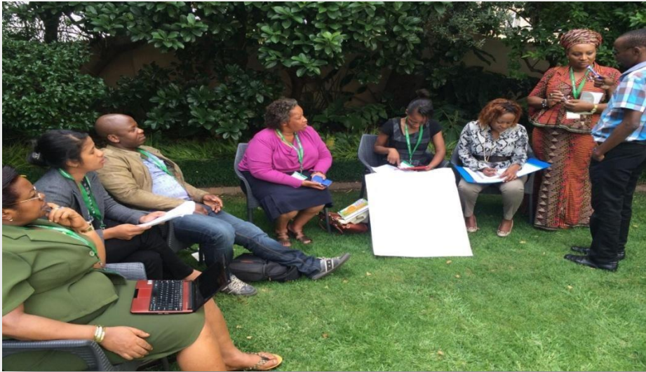
Participants producing communication outputs as well as sharing their experiences (exercise)

TCC in partnership with CTA conducted a training on web 2.0 tools for communication in Puntland state University, Garowe on 2-6 February 2015.