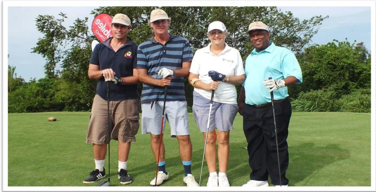
TCC Team golfers at the Gertrude Gardens Golf Tournament