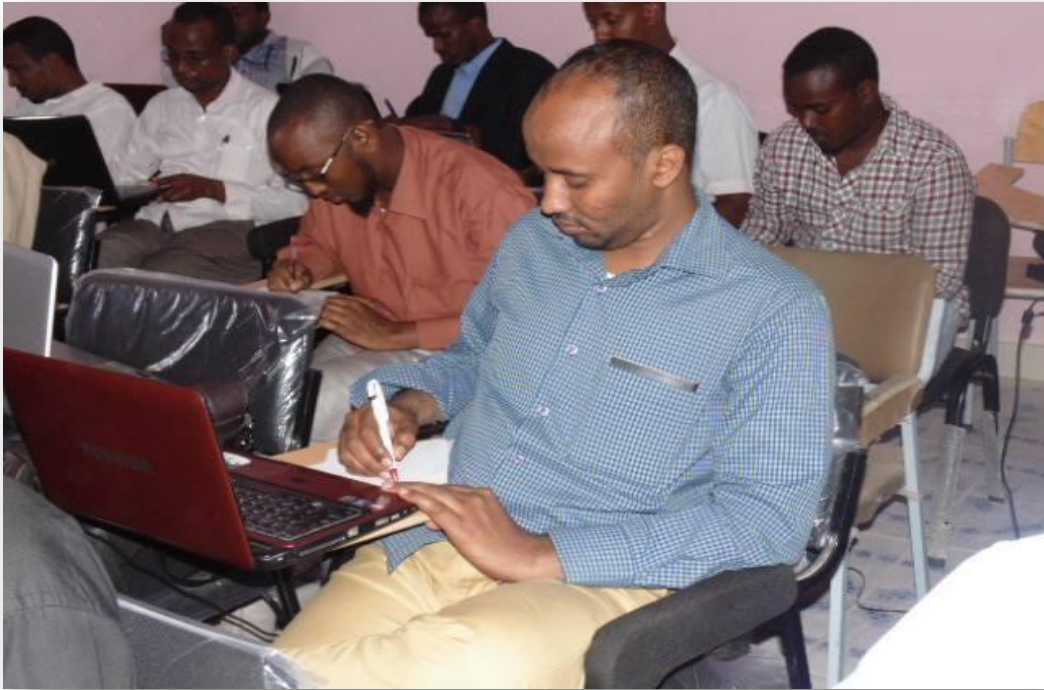
Trainees from Puntland taking notes during the training on the importance of Blogging.