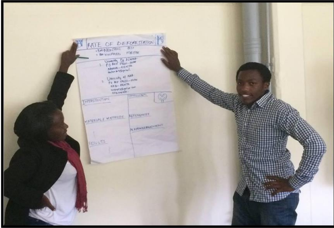
Participants during the poster session by Joy Owango.