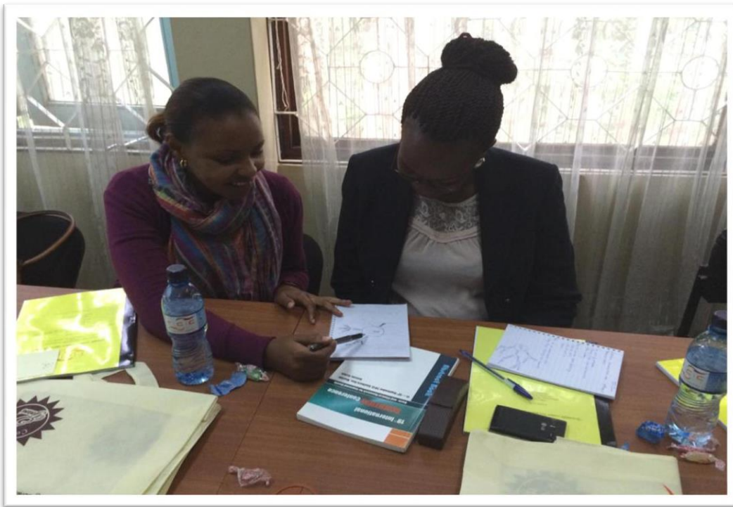
Participants during the exercise in Oral Communication, presentation and networking in conferences