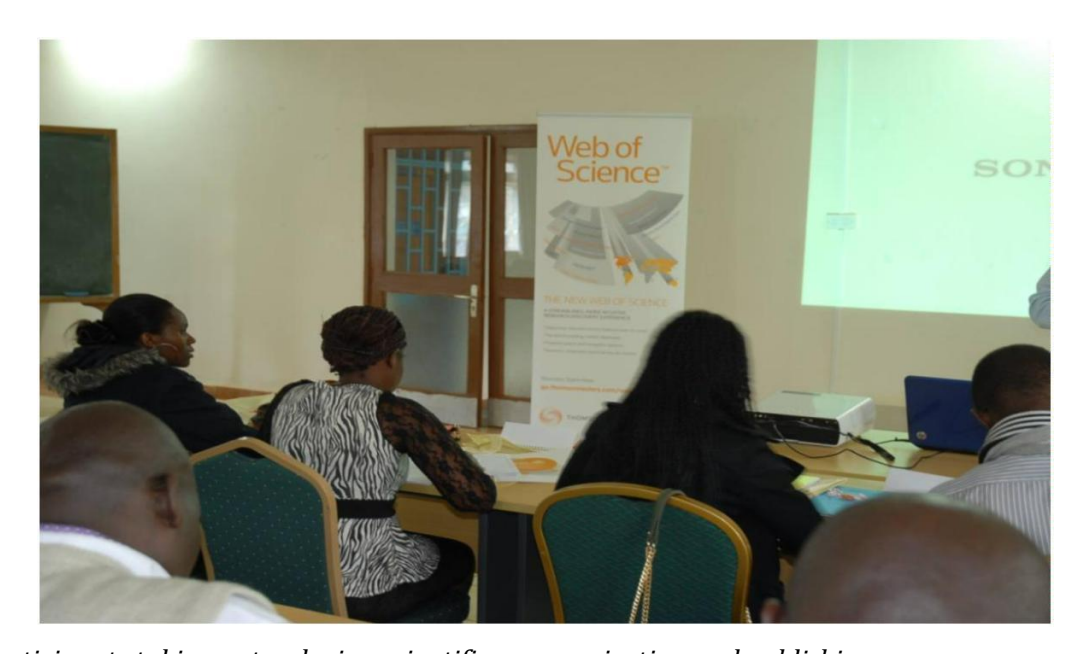
Participants taking notes during scientific communication and publishing course.