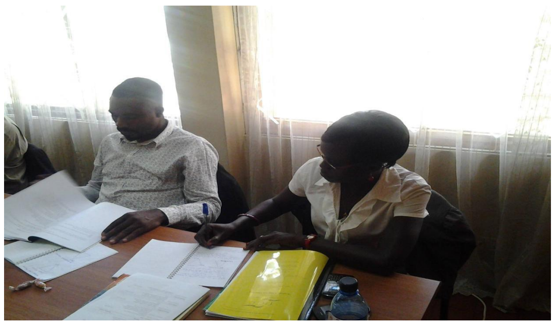
Participants taking notes during the Scientific Writing and Publishing course.