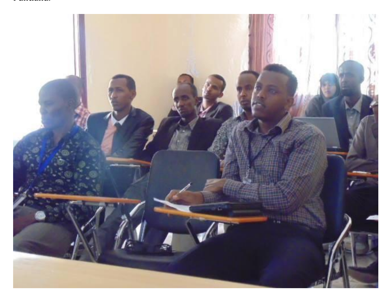
The participants keenly watching a video on the impact of Web 2.0 to a community in Somali Land

TCC with its partner CTA - Technical Centre for Agricultural and Rural Cooperation held the first training on the use of web 2.0 tools to communicate research at Gollis University (<a href="http://www.gollisuniversity.com/">http://www.gollisuniversity.com/</a>), Somalia on 24-28 November 2014. The next training will be in Puntland.