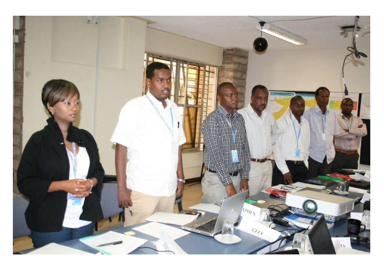
FAO-SWALIM staff during TCC training (Oral communication exercise)

TCC was contracted to train scientists by the Food and Agriculture Organization of the United Nations-Somalia Water and Land Information Management (FAO-SWALIM)