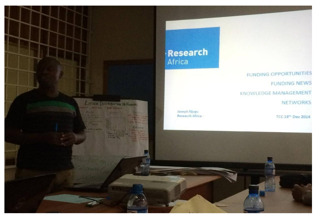
Participant presenting his work at Research Africa during Resource mobilization unit