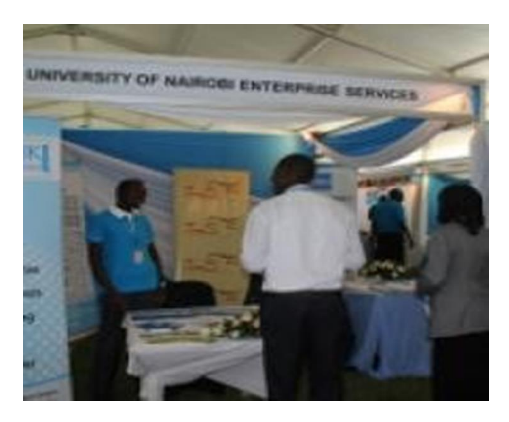
TCC shared a stand with the University of Nairobi Enterprises Services at the University Fair

TCC participated in the 5th University of Nairobi Open Day 2014 in partnership with UNES-KENYA (University of Nairobi Enterprise Services) as from 8^{th} to 10^{Th} April 2014.