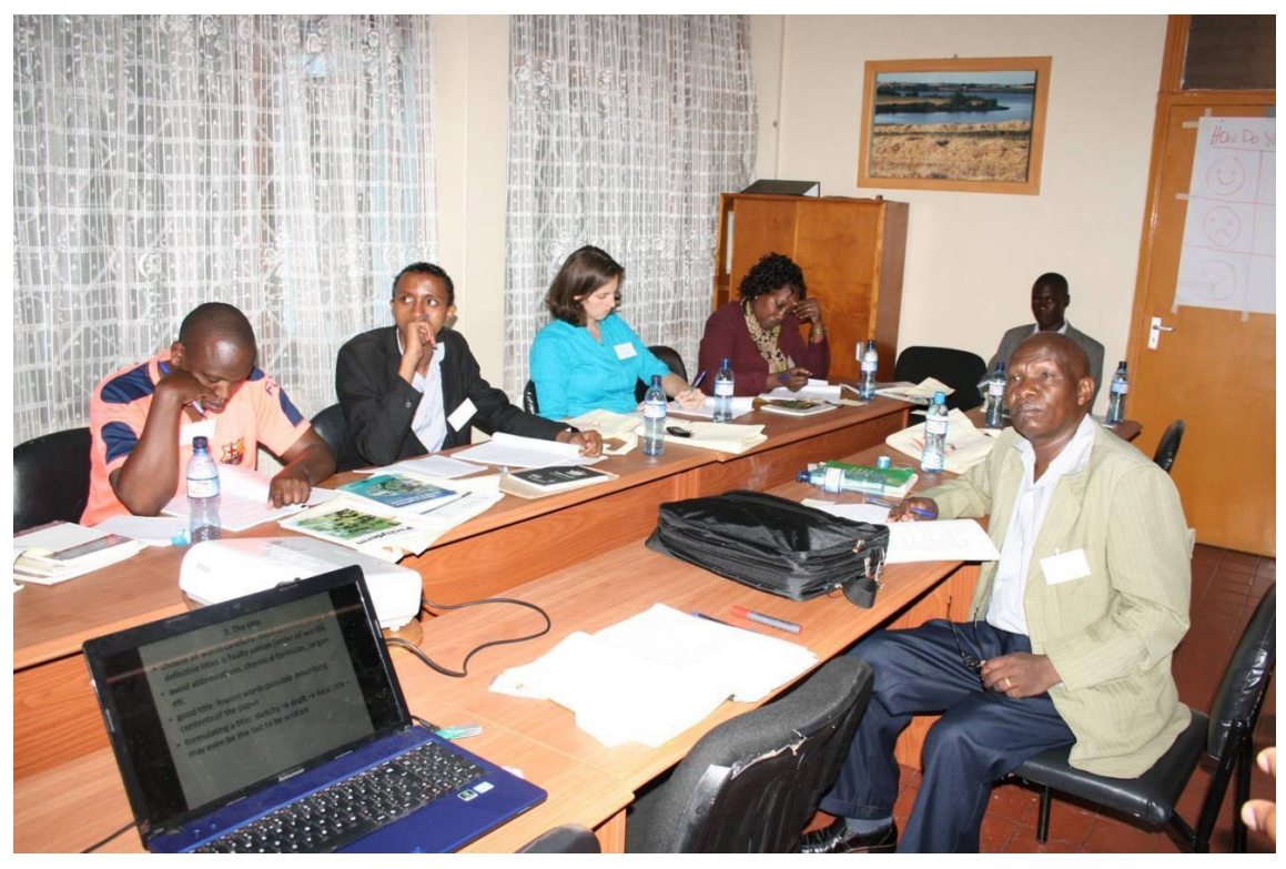
Participants taking notes during the Scientific Communication and Publishing course