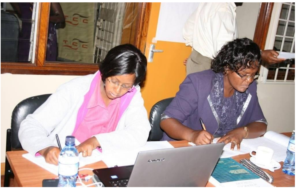
Participants doing the assignment given out during the training of 25th to 28th Feb 2014 at TCC Training room