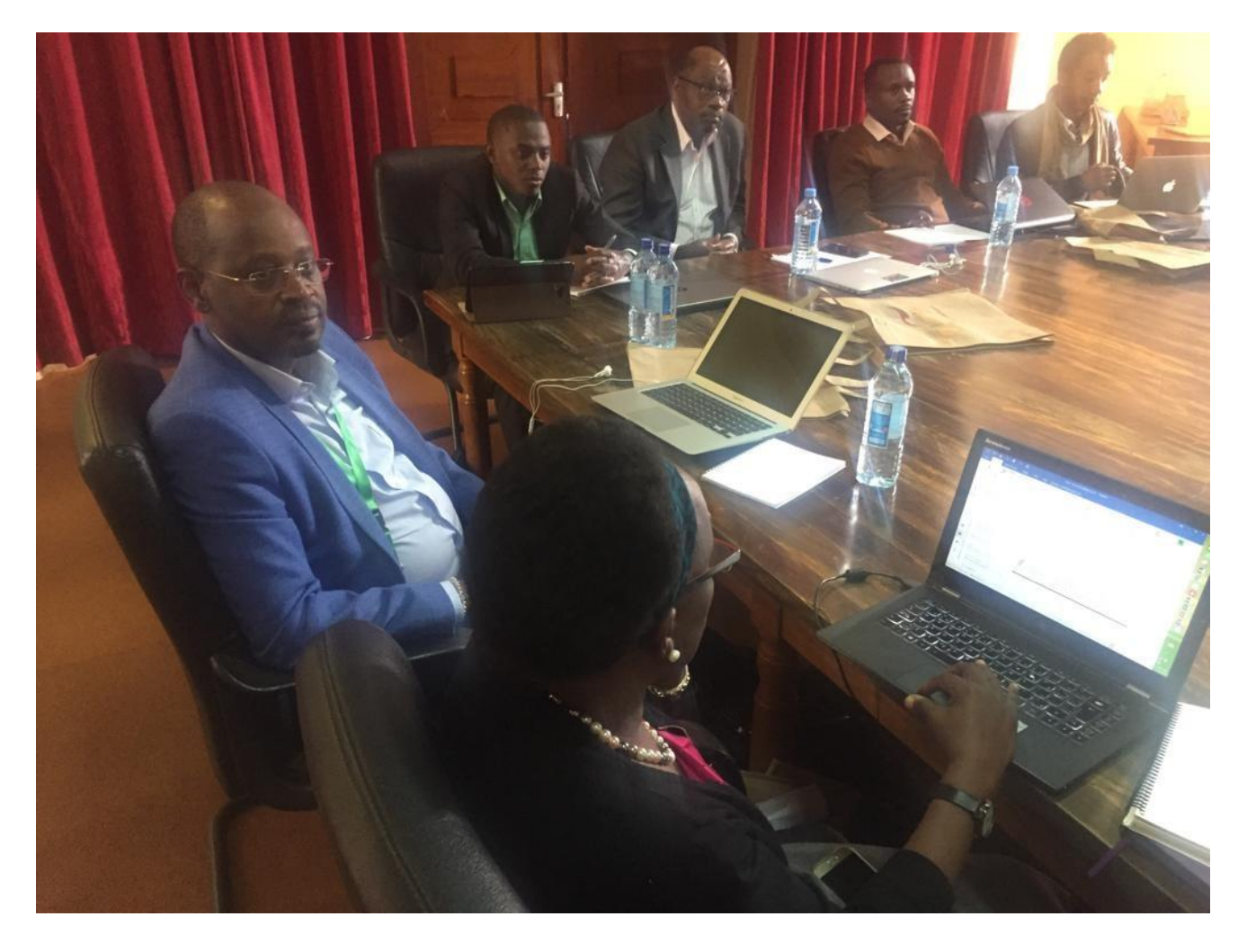
Participating research fellows during a training session at the National Museum of Kenya

Training Centre in Communication conducted a training for JRS Biodiversity Foundation Grantees on 28<sup>th</sup> May, 2019. The training was conducted at the National Museums of Kenya and attracted a sum total of twelve (12) research fellows from Kenya, Uganda, Rwanda, Tanzania, South Africa and Madagascar. The training focused on Science Communication, Communicating to Non Scientist and Developing a Plan