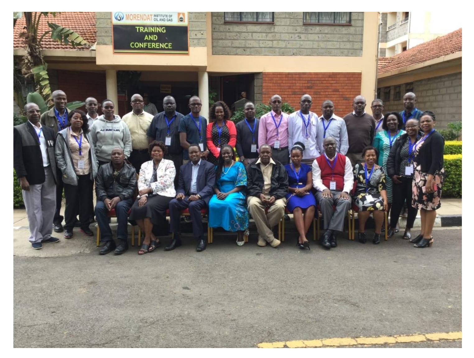
TCC Executive Director together with the Team of Kenya Pipeline Staff during the workshop training

As part of the research capacity initiatives, TCC facilitated a workshop to twenty five (25) Kenya Pipeline researchers on Resource mobilization proposal writing and Grants management at the Morendat Institute of Oil and Gas on the 13<sup>th</sup> of November 2019. The Kenya Pipeline Company (KPC), was setting up a research and grants office and it was an honor for TCC to be part of their journey. The course on Research-Mobilization and Grants management was an integral strategic decision not only to the institute but to the researchers who will be part of the ream raising money to conduct research. Raising funding for research is part of the research discovery process and it is important for scientist to know the various ways in which to go about this process.