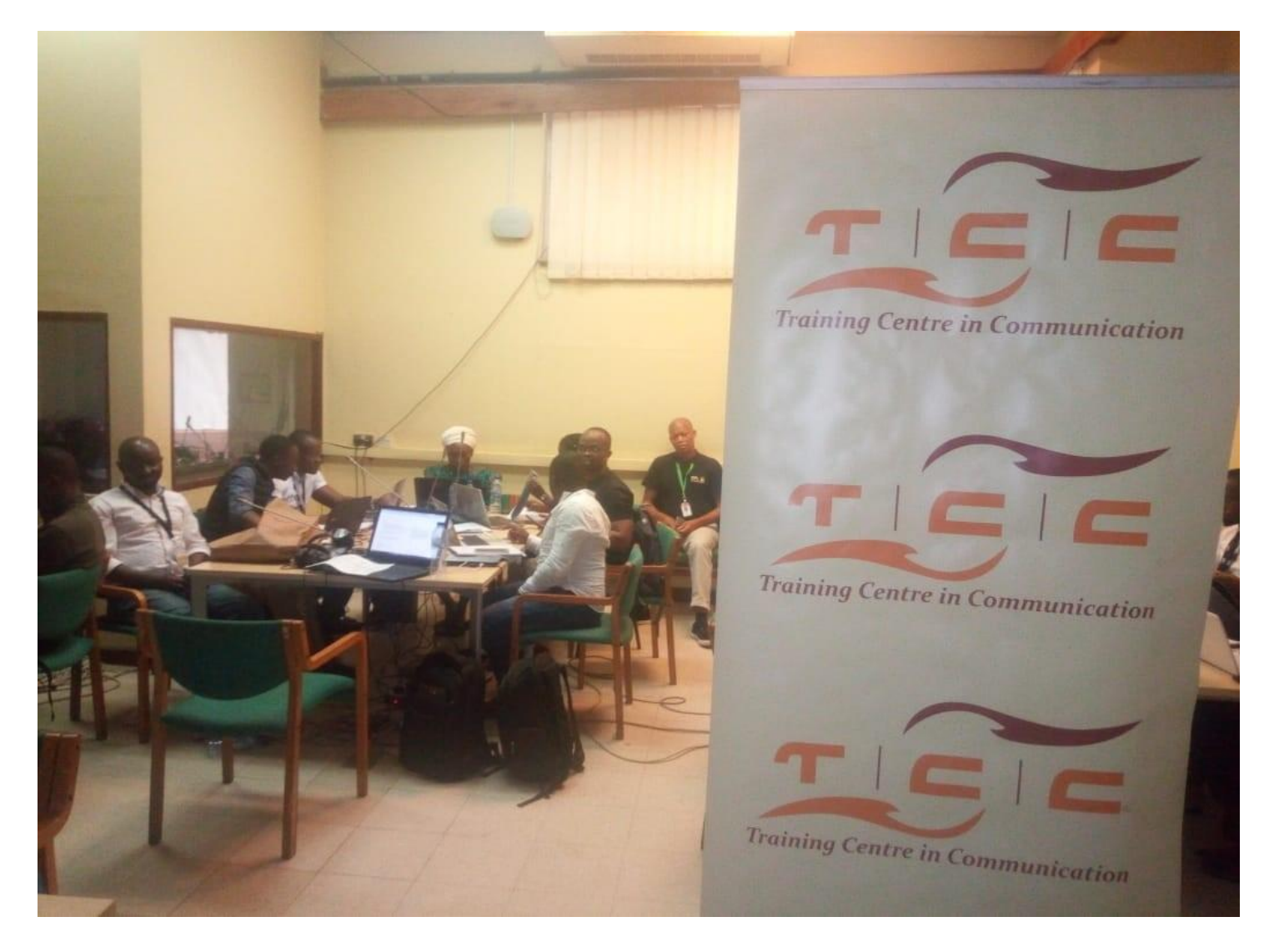
Agricultural scientist's participants from IITA CGIAR Nigeria during the training.

Training Centre in Communication conducted a training for agriculture scientists from IITA CGIAR on the 14<sup>th</sup> to the 15<sup>th</sup> of November, 2019. The training which was conducted in Ibadan state of Nigeria had thirty (30) participants at MSc and PhD level. The training was centered on Academic Writing and Publishing, Open Access and Oral Communication. Beyond writing academic papers and understanding the academic publishing industry, TCC also trained the researchers on how to communicate with fellow scientist which in turn guides them on working and communing at a multidisciplinary level with their peers.