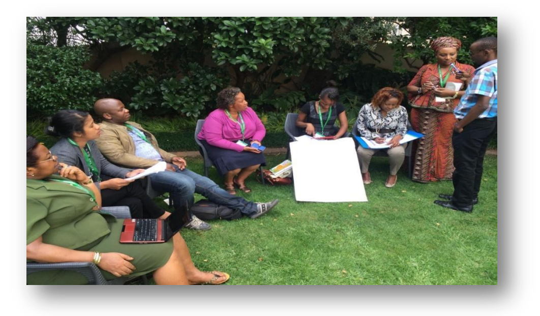
Participants producing communication outputs as well us sharing their experiences (exercise)

TCC in partnership with CTA conducted a training on web 2.0 tools for communication in Puntland state University, Garowe on 2-6 February 2015.