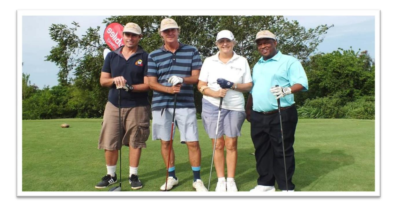
TCC Team golfers at the Gertrude Gardens Golf Tournament

• TCC sponsored the Gertrude's Hospital Foundation Mombasa Charity Golf Tournament that was held in May at Vipingo Ridge Resort, Mombasa. TCC has been working with Gertrude Gardens Children Hospital since 2006.