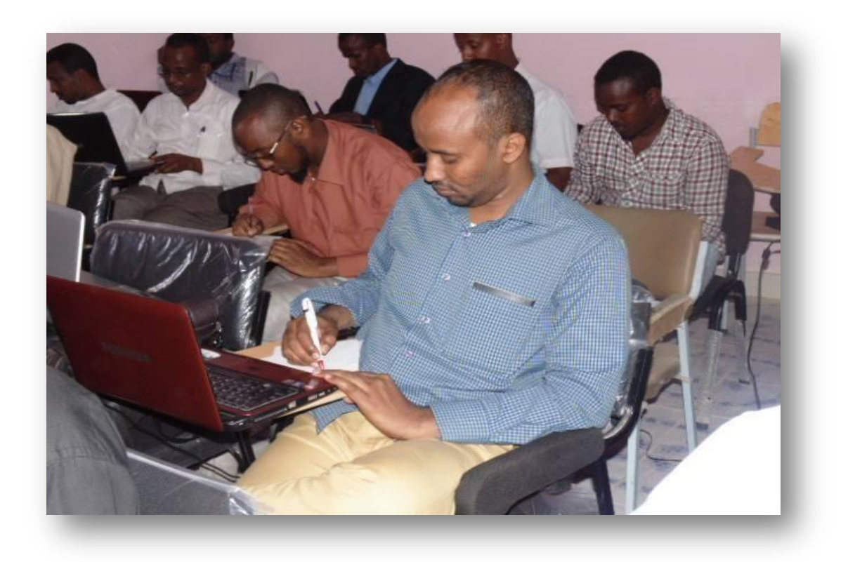
Trainees from Puntland taking notes during the training on the importance of Blogging.